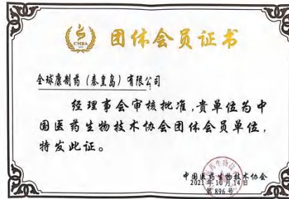
Member unit of China Medical Technology Association