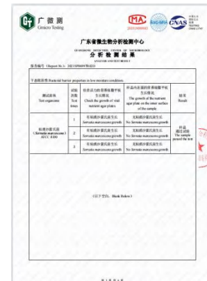
Bacterial Barrier Properties Report