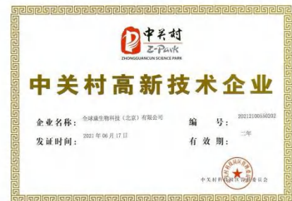
Zhongguancun High-tech enterprise