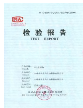
Quality supervision Bureau inspection report