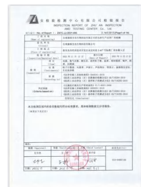
Purification workshop inspection report