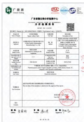
Bacterial endotoxin Report