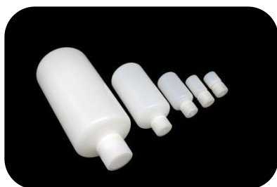
Wide Mouth Reagent Bottles