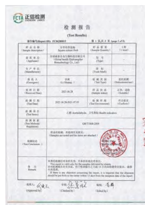
Acetaldehyde and Health indicators Report