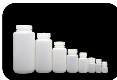
Wide Mouth Reagent Bottles